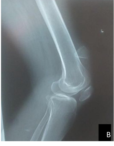
Figure 2: Preoperative Anteroposterior (A) and lateral (B) radiographs showing wide separation of patella fragments with sclerotic margins.

After admitting the patient, isometric quadriceps strengthening exercises were given to him for three weeks together with the physiotherapy unit before the operation because the quadriceps muscle was atrophied, and