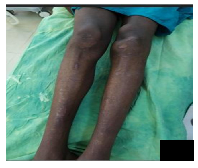
Figure 1: Figure 1: Preoperative photograph of left knee showing wide gap of patella

On physical examination, there was a visible deformity and a gap seen on his left knee area, which measured about 5-6 cm. There was quadriceps muscle atrophy, the superior part of the patella was palpable over the distal thigh, and the lower pole of the patella was palpable just above the left tibial tuberosity. With an impression of a neglected left patella fracture, an AP and lateral knee radiography was taken and showed a significantly displaced patella fracture measuring about 6 cm with sclerotic borders. The patient was advised about the clinical condition and the advantages as well as the possible complications related to surgical intervention, and he decided to be operated on.