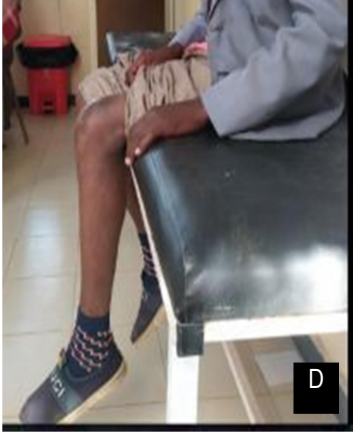
Figure 5: Postoperative photographs showing knee flexion in a sitting position at 6 weeks (A), 3 months (B), and 6 months (C, D) postoperative period

The use of the single-stage and double-stage tension band methods for the treatment of neglected patella fracture is mostly applied but they have their limitation for instance in single-stage double tension band wiring methods when the neutralizing wire is applied if the wire is over tightened then the risk of developing patella Baja is high which leads to knee pain, restricted knee range of motion, and it can also result in premature osteoarthritis unless it applied under image intensifier and Double stage surgery has also a problem because the presence of external fixator (iliizarov) or skeletal traction poses mental trauma to the patient along with surgical complication like bone weakening, pin loosening, pin tract infection and prolonged duration of treatment even if it has shown good result by Dhar and mir (8,12) with knee range of motion of 0 to 135-degree flexion.