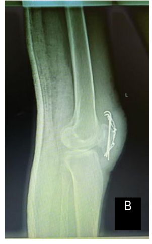
Figure 4: Postoperative anteroposterior (A) and lateral (B) radiographs